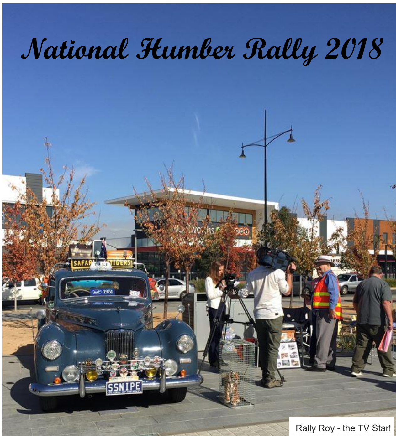
Rally Roy - the TV Star!