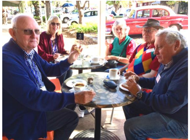
...Yackandandah - morning tea