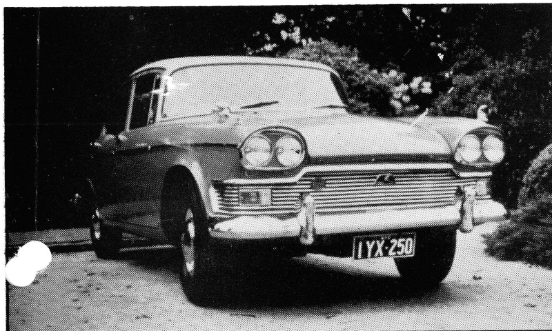
Ser. 111 Snipe IYX-250 Most desirable car HCCV Concours 1979 Owner: Ralf Chalmers.