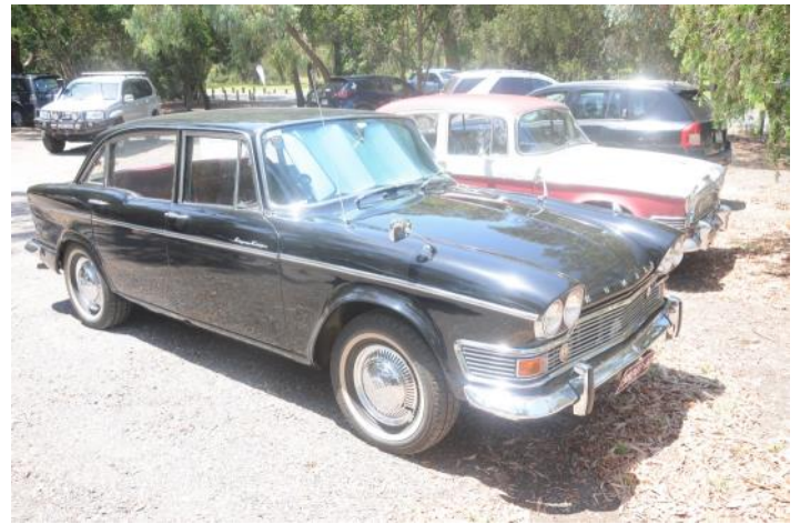
Bernie and Jo’s Series V Humber Super Snipe in front of Murray and Jodie’s Series I Super Snipe