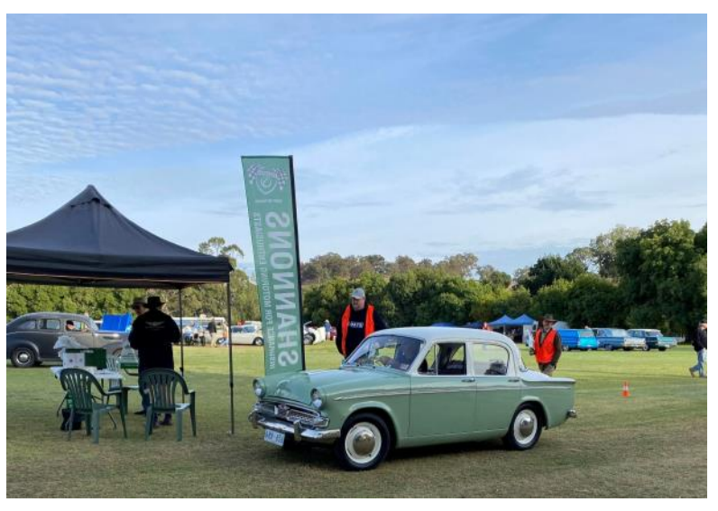
Here's a game for you - find MM4!