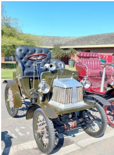
1901 Argyll 5hp