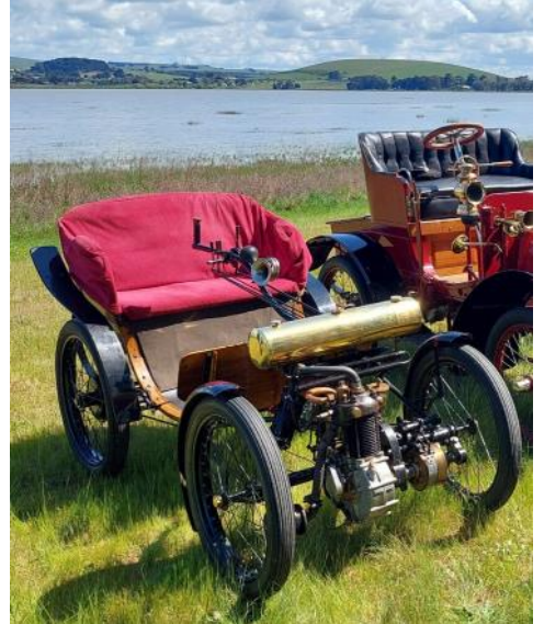
1900 Victoria Combination Voiturette