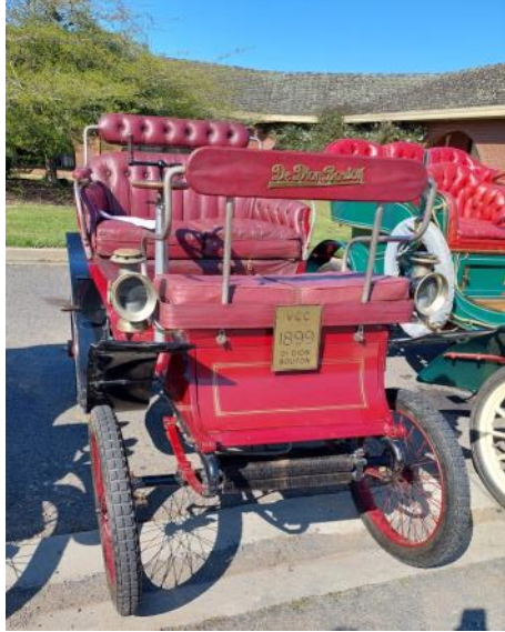
1899 De Dion Bouton Vis a Vis