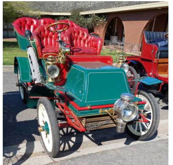
1902 Thomas Model 17