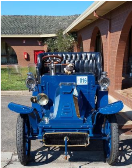
1904 De Dion Bouton Q