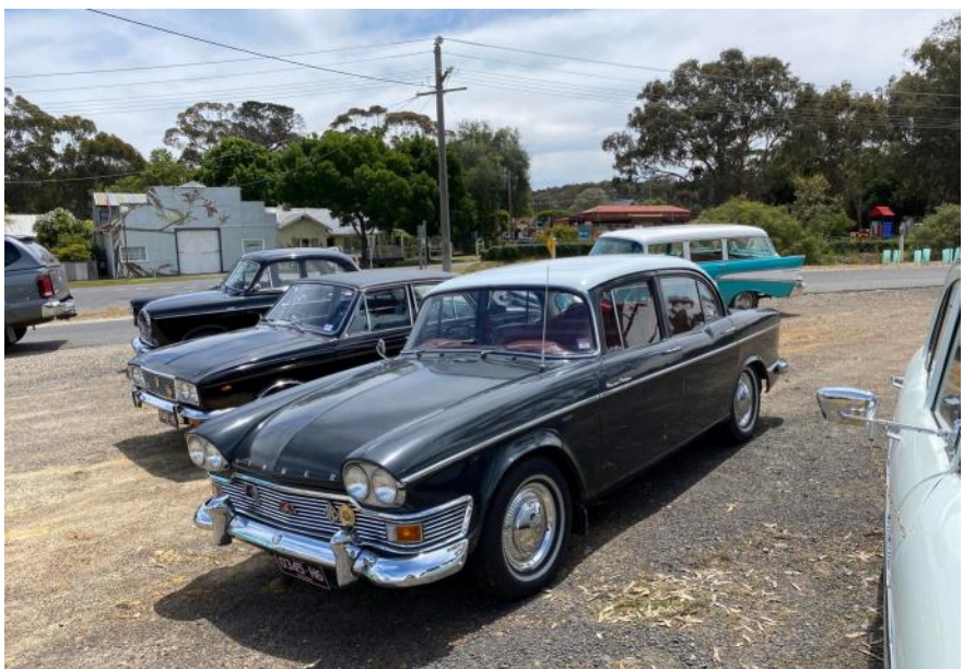
Bob Beaumont - 1964 Ser IV