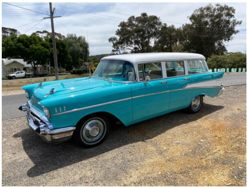
Uncle Laurie - 1957 Chevrolet 210 Series Townsman Station Wagon