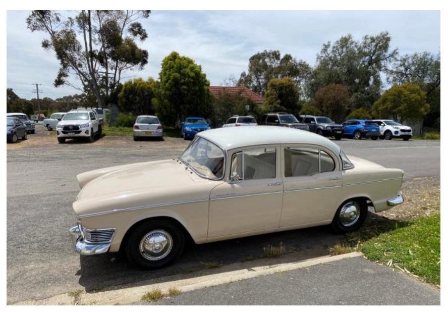
Rod & Majella Burchill - 1961 Ser III