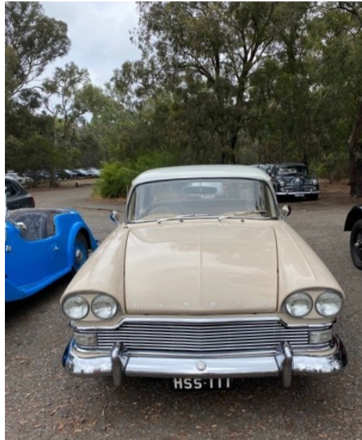
Rod & Majella Burchill's Ser III Super Snipe