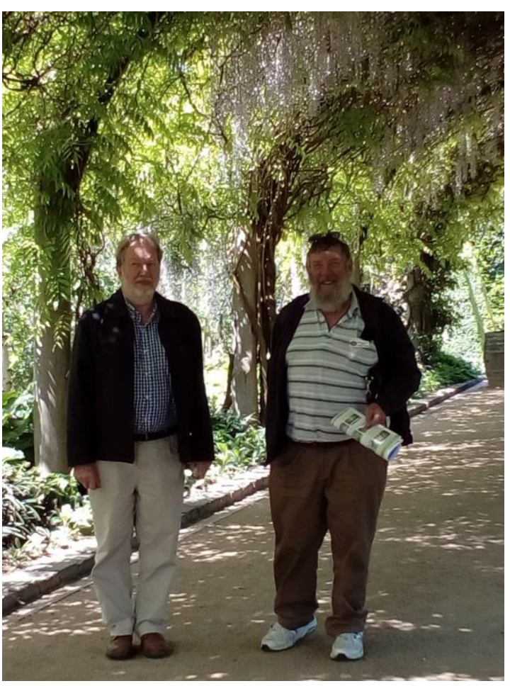
Oh and the chocolate factory is just next door, not to even mention the Wineries!

For those who haven't been to Alowyn, the roses will be in full bloom on Cup Day. It's a great relaxed environment, the cafe is surrounded by interesting buildings, things to buy, places to sit quietly, sip coffee, eat a scone, walk around the garden and end up in a beautiful nursery where you can purchase any of the plants you might have desired and seen in the gardens.