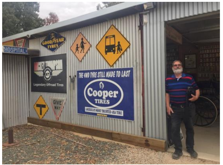
Raverty's Motor Museum