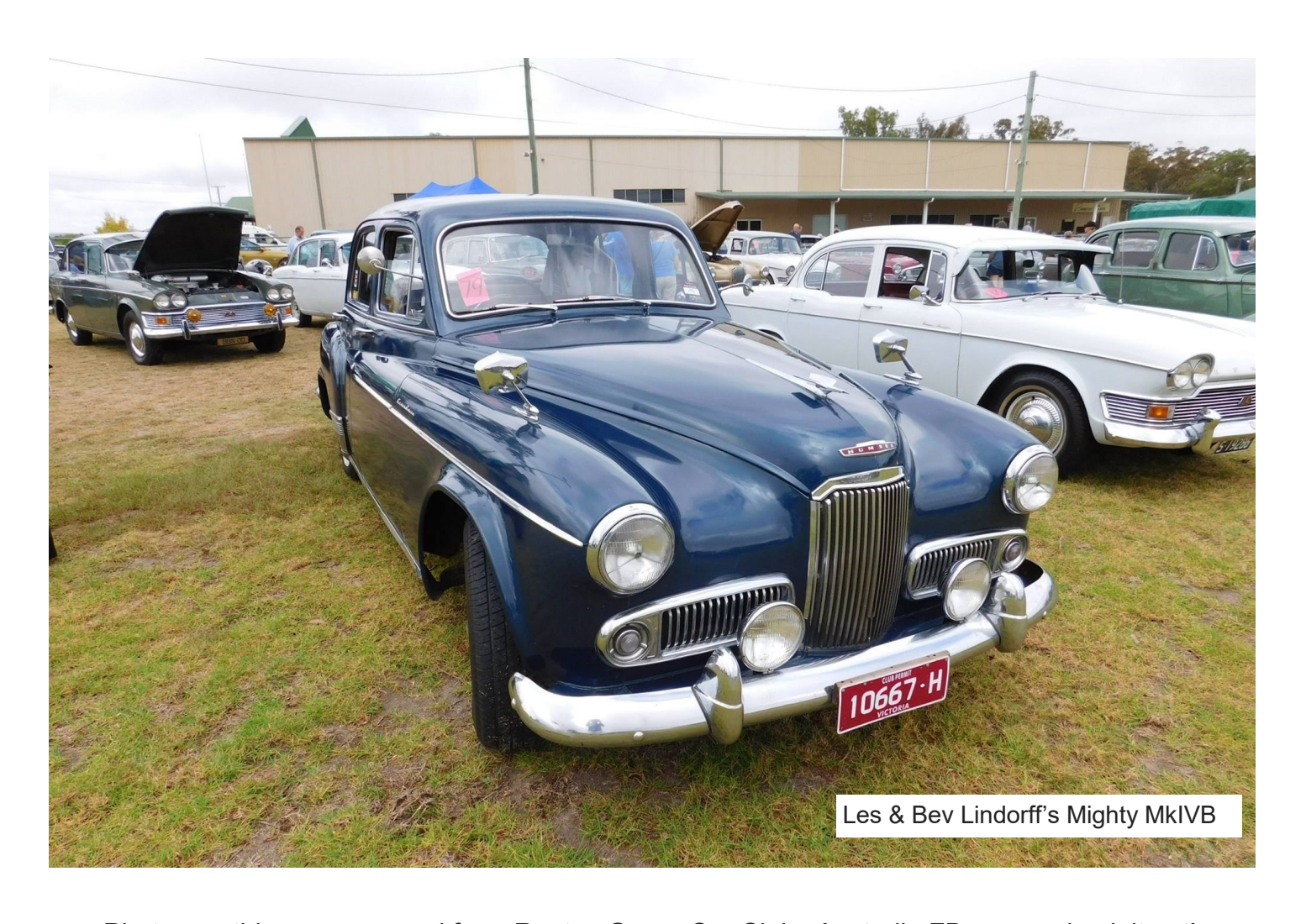
Photos on this page sourced from Rootes Group Car Clubs Australia FB page - check it out!