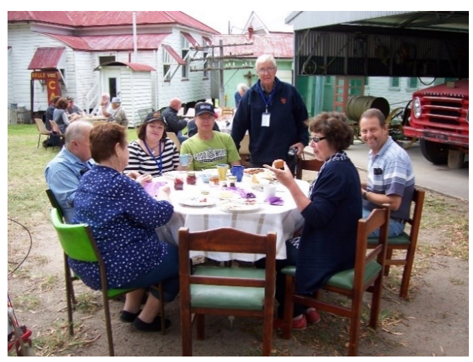
A very friendly gathering with everyone tucking in to a plentiful breakfast before leaving to go their separate ways, hoping to meet again.