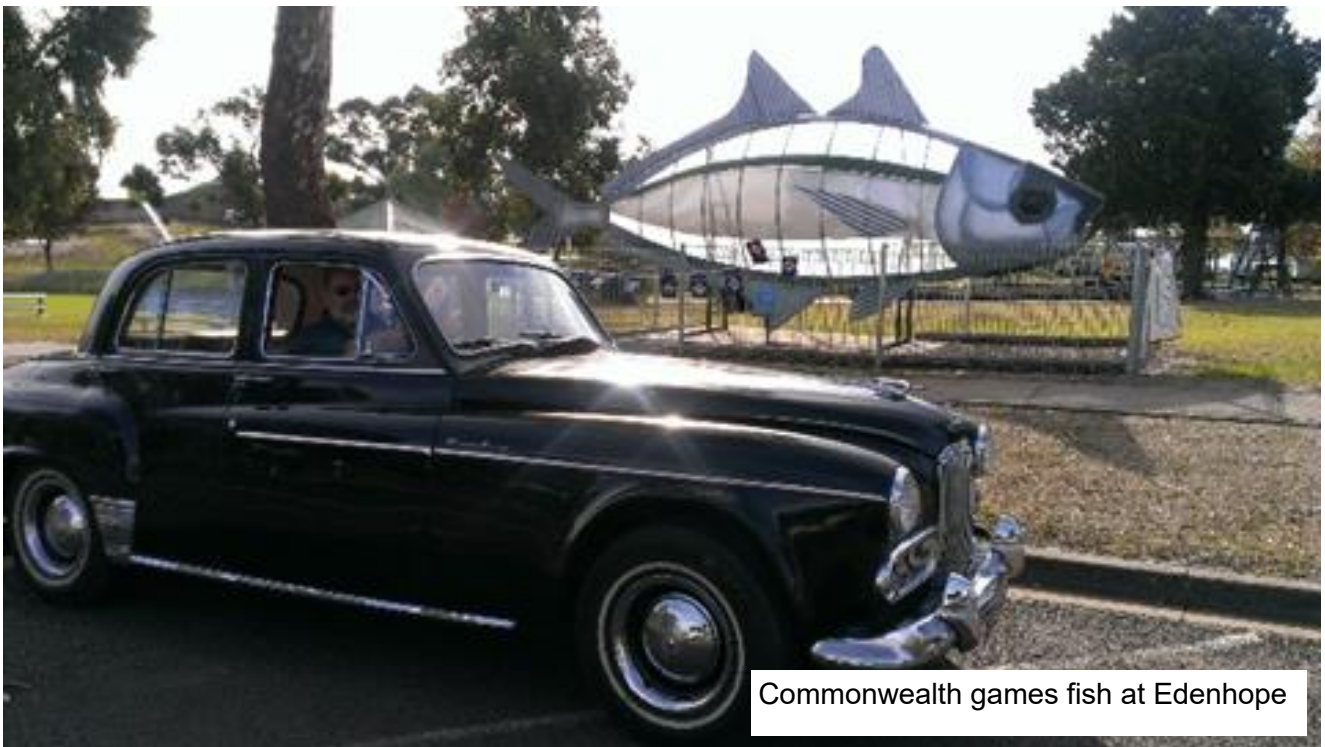
Commonwealth games fish at Edenhope

Then we come across this Bikini tree 10km short of Edenhope. We just had to turn around to have a closer look. Not an easy feat in a 57 year old vehicle. The tree was covered with shoes with one lonely bikini top, which is what I saw when hurtling past.