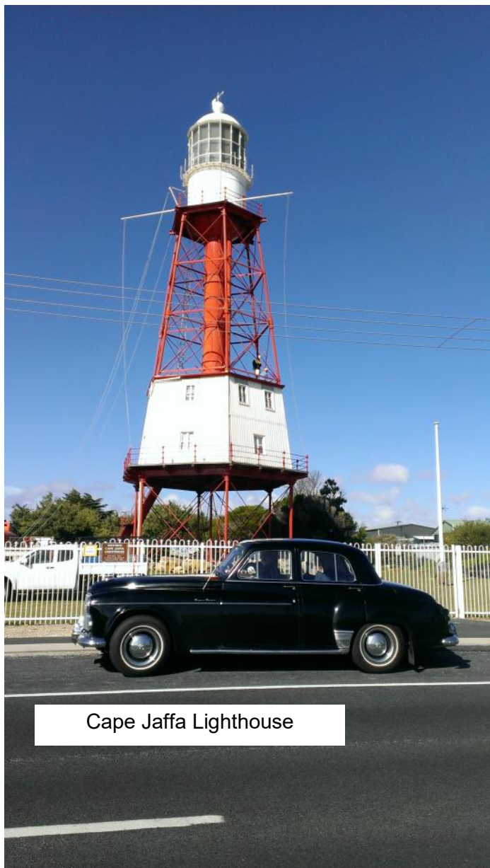
Cape Jaffa Lighthouse

Just to be different, we went down the Coorong road to Kingston. After ½ an hours driving, the weather